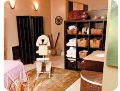
YMCA of Greater Erie's new Natural Healing Therapeutic Center opened in 2011.